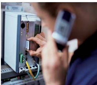
The ProServ Supreme program includes access to manroland's exclusive TeleSupport